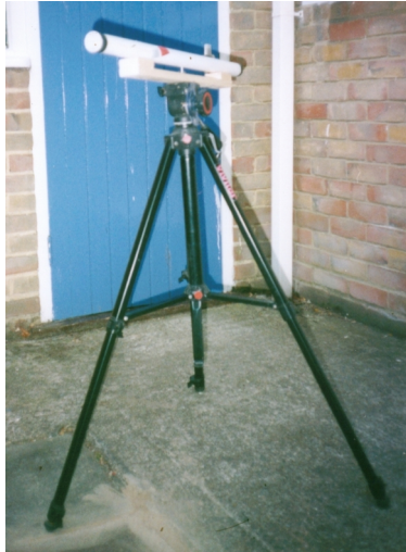
Figure 1 : The "Junk-scope"

Steps 2 to 5 are repeated to allow 5 measurements to be taken as close to the sidereal date and time incremented from 22:21 on 25/8/03 as possible. If any reading is judged uncertain an extra reading may be taken. All readings are recorded. In this manner 104 measurements were made over 21 nights between 25 th August and 26 th October.